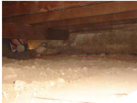
Under a house, doing a Subterranean Termite Treatment