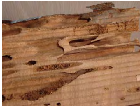
Drywood Termite Damage