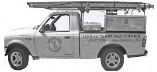
Our Pest Control Department is always ready to help