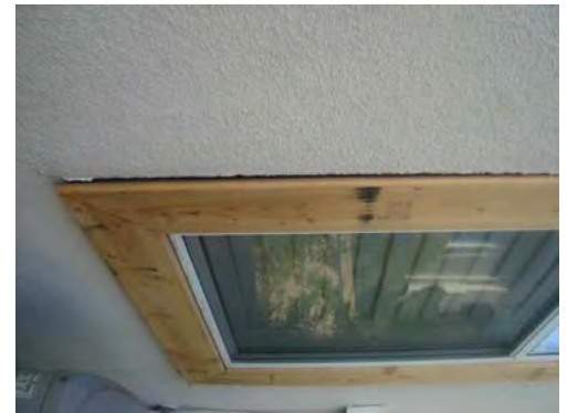
The other guys work