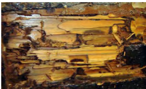
More Subterranean Termite Damage