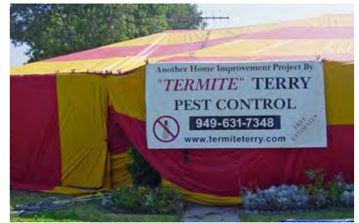
Our Fumigations are always handled professionally