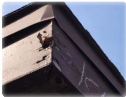
Drywood Termite Damage (KD) Corner Fascia