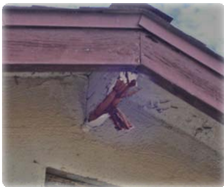
Drywood Termite Damage (KD) Rafter

shrubs and fence areas are important to check regularly because termites come from depleted food source and move to a new food source like your home. Ask your neighbors about their experience of problems with termites. Chances are if they have had instances with these pests, YOU WILL TOO!