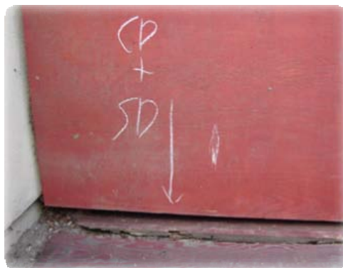
Cellulose Debris (CD) and Subterranean Termite Damage (SD)