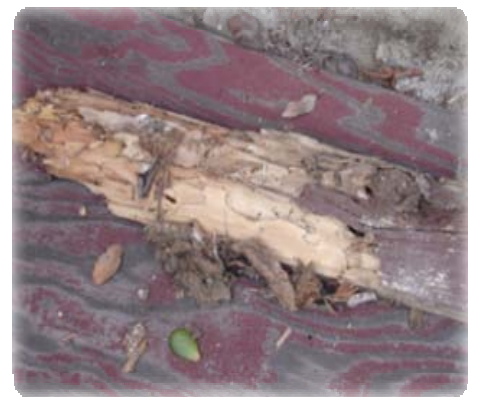
Subterranean Termite damage