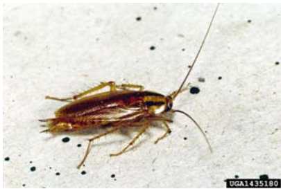
German Roach ( Blattella germanica )

They also tested these products by applying them to a variety of surfaces, such as on painted drywall, ceramic tile, and stainless steel. Testing showed that these products performed significantly worse when applied on drywall. This suggests that porous surfaces may have a significant impact on product efficacy.